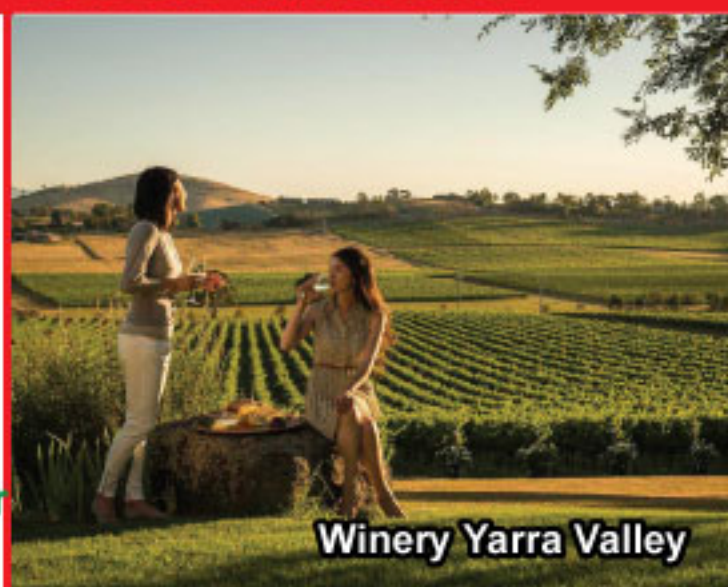
Winery Yarra Valley

Sequences of Itinerary are subject to local arrangement.