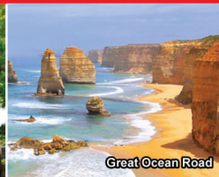
Great Ocean Road