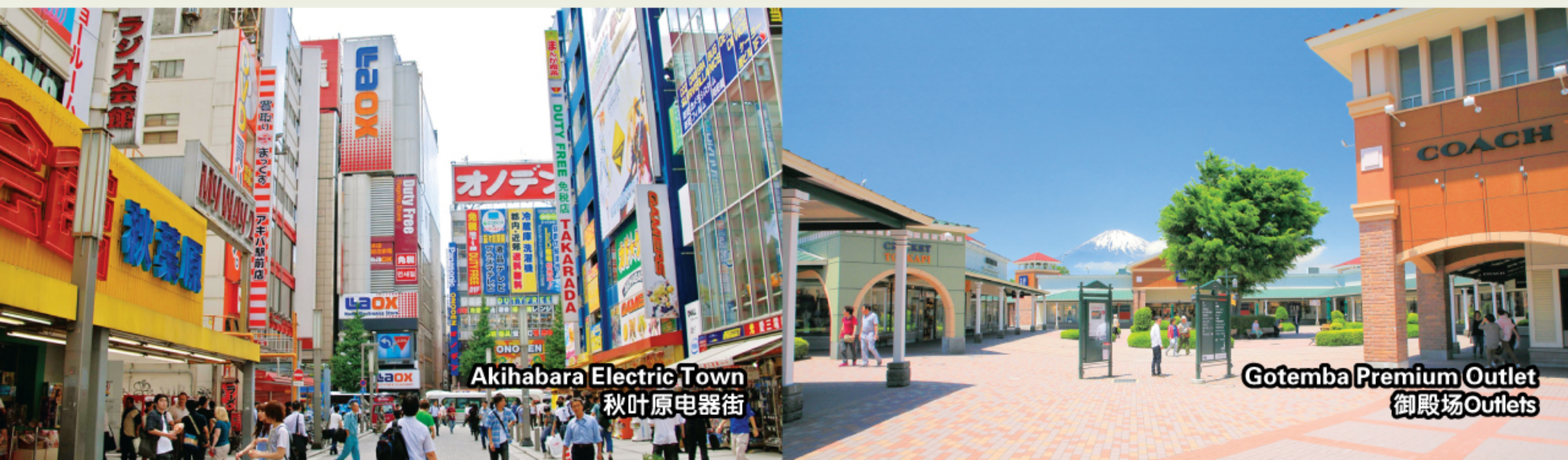
Akihabara Electric Town 秋叶原电器街