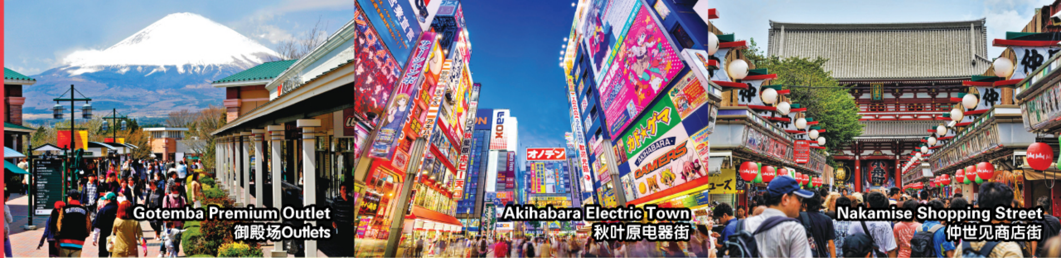
Gotemba Premium Outlet 御殿場Outlets