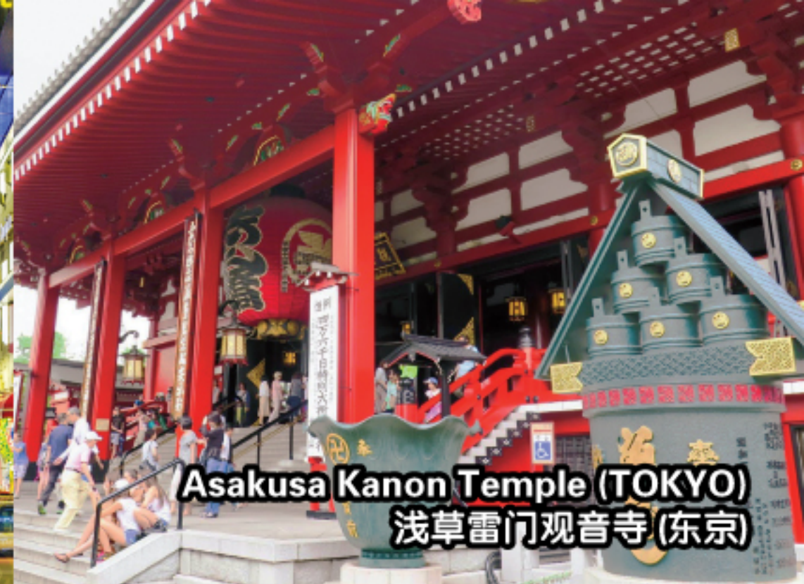
Asakusa Kannon Temple (TOKYO) 浅草雷门观音寺(东京)