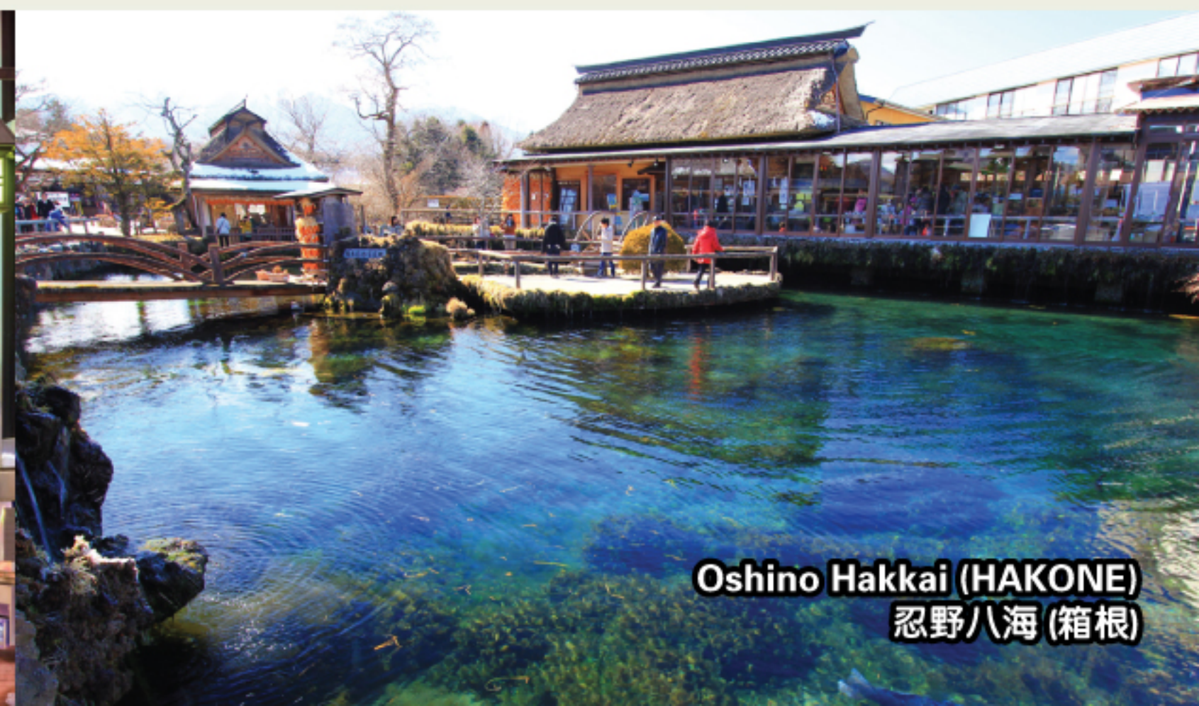
Oshino Hakkai (HAKONE) 忍野八海(箱根)