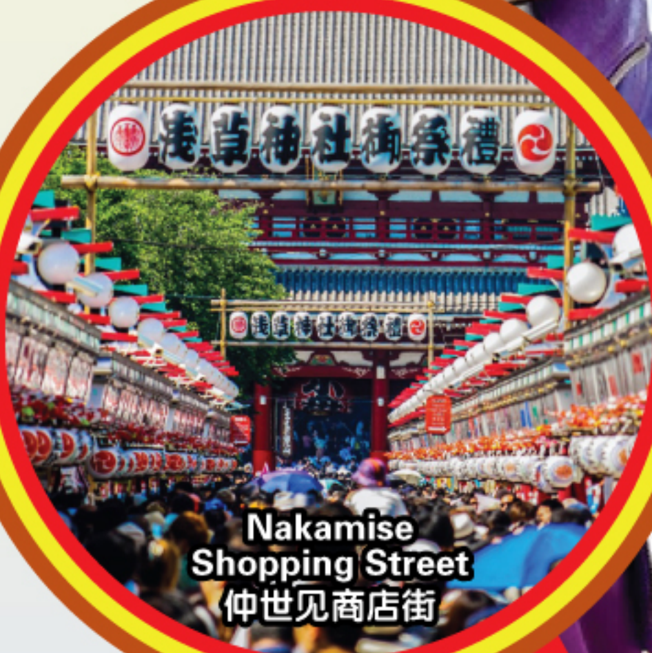
Nakamise Shopping Street 仲世见商店街