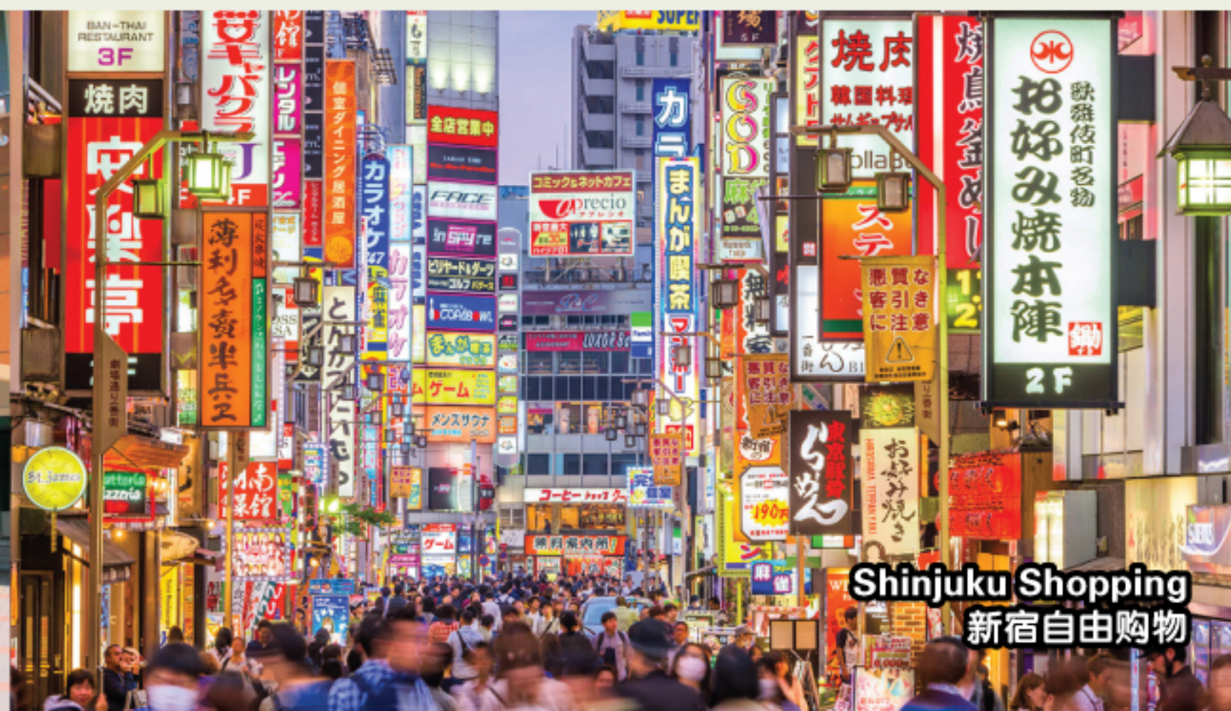
Shinjuku Shopping 新宿自由购物