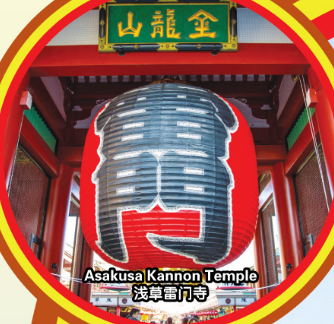
Asakusa Kannon Temple 浅草雷门寺