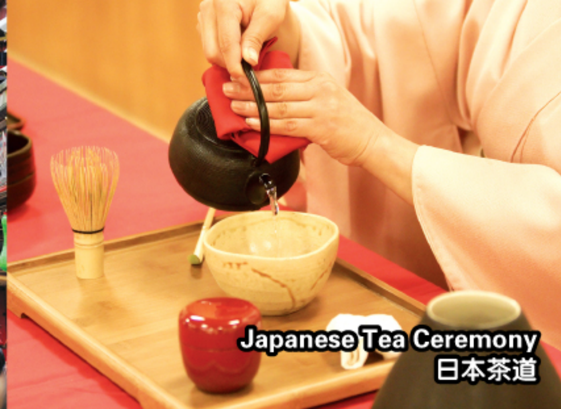
Japanese Tea Ceremony 日本茶道