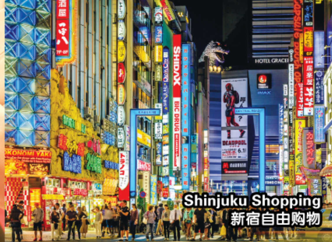
Shinjuku Shopping 新宿自由购物